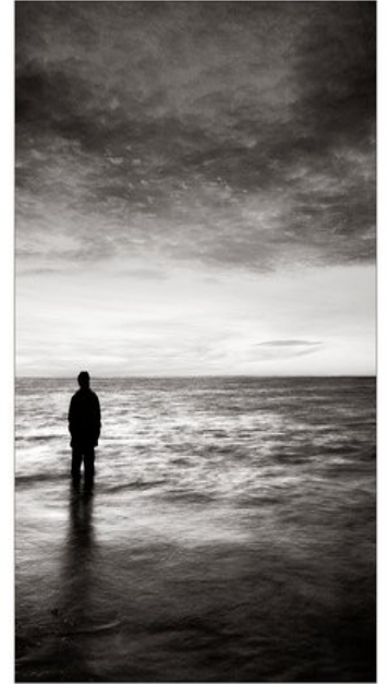
SOUND OF SILENCE

Las historias de Jesús, en los cuatro evangelios, nos dicen que El frecuentemente se apartaba para ponerse en oración. Él utilizó este tiempo para silenciar el ruido de la muchedumbre y para, en silencio, conectarse con el Padre. En la quietud de la oración, Jesús se encontró con la experiencia de su próxima crucifixión y en el silencio de las tempranas horas de la mañana, El resucito triunfante. Cuando aprendemos a utilizar el silencio con eficacia, podemos hablar al mundo con una voz poderosa. ¡Porque es la voz de Dios, del Padre, el Hijo y el Espíritu la que transmitimos a un mundo que se encuentra tan deseoso de escucharle!